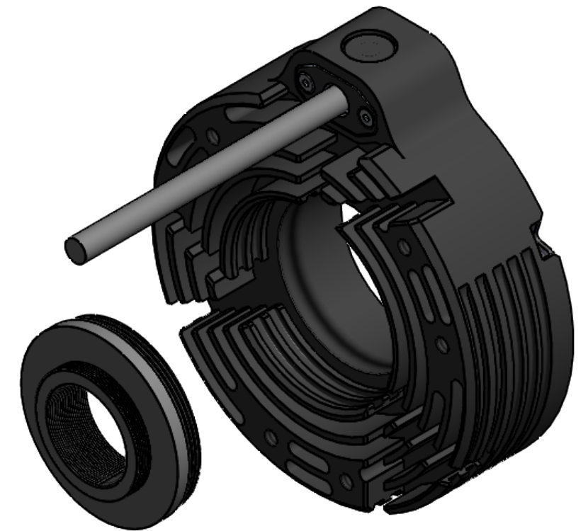
Isometric View SCALE 1:1